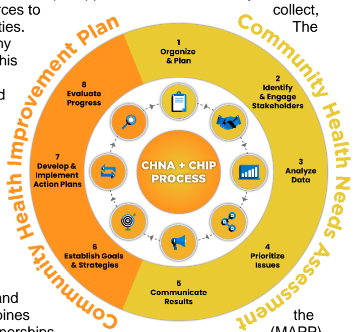
Figure 1: AHER CHNA combined process

The community health needs assessment and health improvement planning process combines mobilizing action through planning and partnerships engaging patients and communities is health assessments, and community health improvement navigator frameworks to ensure it meets the required needs of all partner organizations involved.