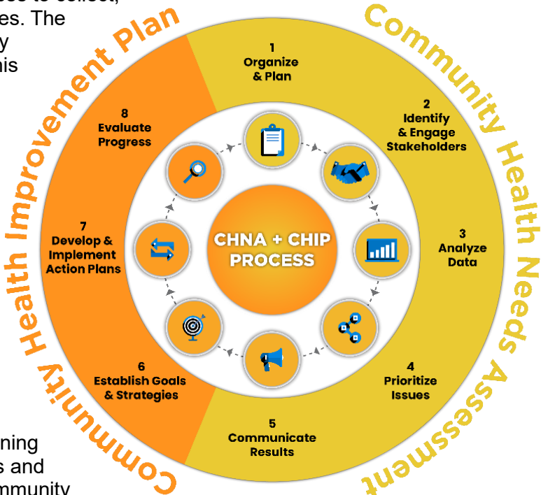
Figure 1: AHER CHNA combined process

Escambia and Santa Rosa Counties adopted a unique approach to the community health assessment (Figure 1) by combining resources to collect, assess and address problems in both counties. The process was directed by the Achieve Healthy EscaRosa collective impact organization. This organization relies on a diverse group of community partners from both counties. Led by representatives from our community’s non-profit hospitals and University, with technical assistance from the Florida Department of Health in both counties, Achieve Healthy EscaRosa partners worked together to identify the resources and capacity of the community for impacting the identified significant needs from the 2022 Community Health Needs Assessment.