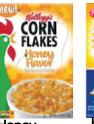
Honey Frosted Corn Flakes