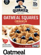
Oatmeal Squares Cinnamon