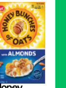
Honey Bunches of Oats with Almonds