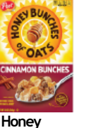
Honey Bunches of Oats Cinnamon Bunches