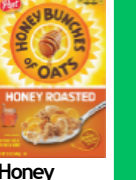
Honey Bunches of Oats Honey Roasted