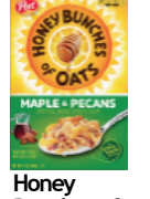
Honey Bunches of Oats Maple Pecan