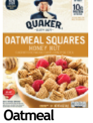
Oatmeal Squares Honey Nut