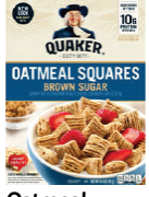
Oatmeal Squares Brown Sugar