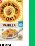
Honey Bunches of Oats Vanilla