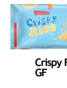
Crispy Rice GF