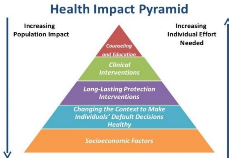
FIGURE 4: HEALTH IMPACT PYRAMID