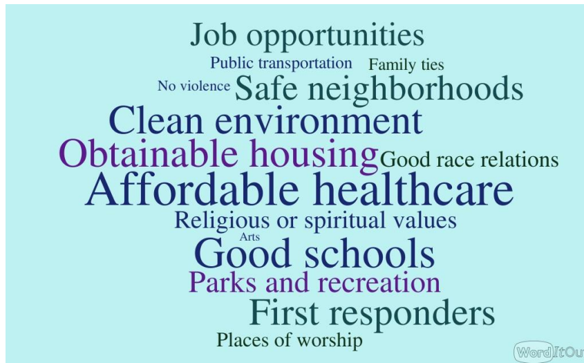
FIGURE 5: FACTORS THAT DEFINE HEALTH, BRADFORD COUNTY, 2023