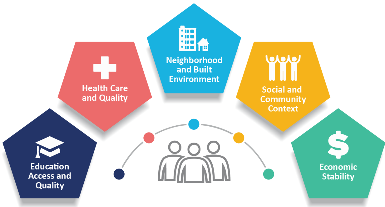
FIGURE 3: SOCIAL, ECONOMIC, AND OTHER FACTORS THAT DETERMINE HEALTH