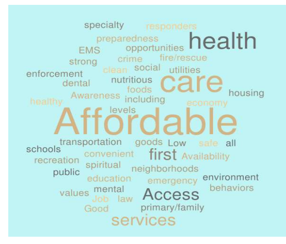
Source: Putnam County Community Health Survey, 2021. Prepared by WellFlorida Council, 2021