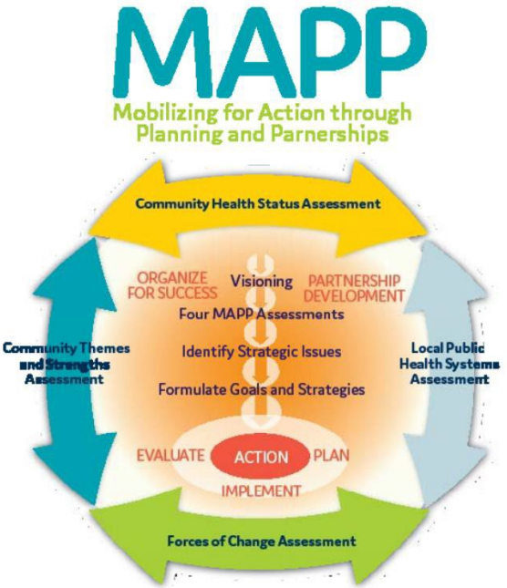
Figure 2, to the left, shows the MAPP process that notudes the Community health status assessment, ocal public health system assessment, forces of change assessment, and community themes and strengths assessment.

MAPP is a community-driven strategic planning process for improving community health and is comprised of four individual assessments. Achieve Healthy EscaRosa utilizes these four assessments along with the other health assessment framework for development of our community health assessment and subsequent improvement plan